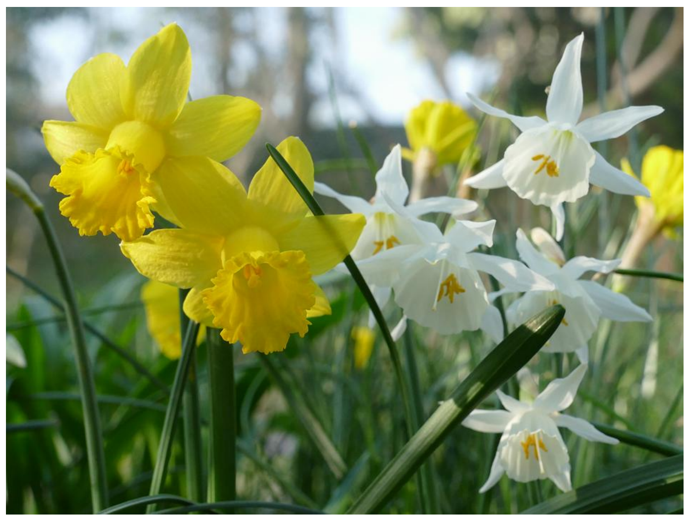
Narcissus 'Maggi Young' and Narcissus 'Ian Young'