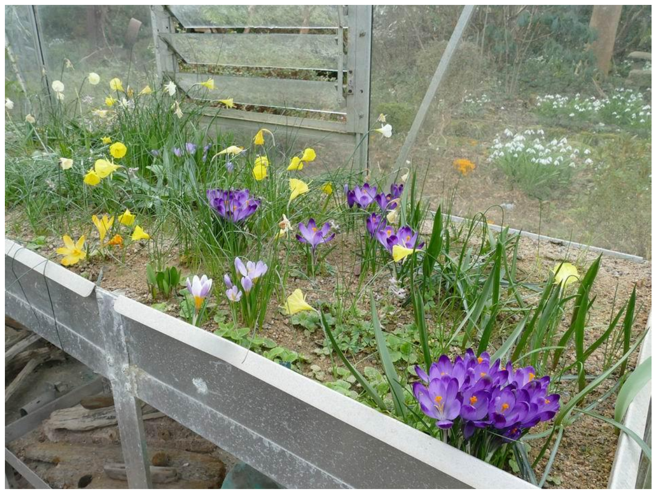
The flowers in the sand beds enjoy some degree of protection from the weather.

In recent years we have greatly reduced the number of bulbs we grow in pots - developing mixed plantings directly in the sand plunges where we can enjoy the plants without the need to repot them every year.