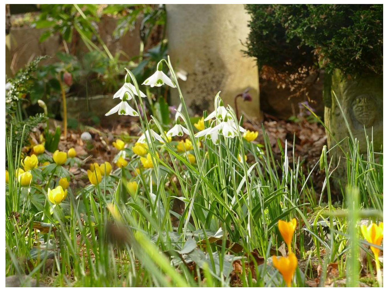
Allowing the plants to seed around will give a more naturalistic appearance.

Our garden is evolving as a partnership with nature alongside any additions or interventions we make; being less tidy and allowing natural mulches to cover and enrich the soils. Splitting clumps and planting the bulbs out in a more natural looking arrangement.