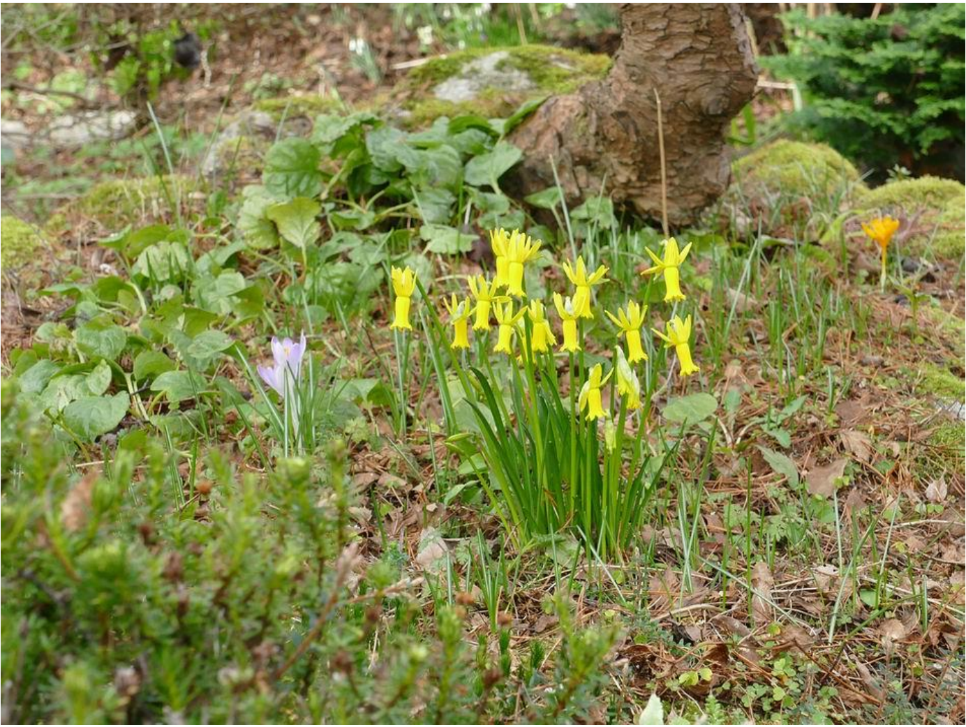
Narcissus cyclamineus grows well, naturalising as it seeds around the garden.