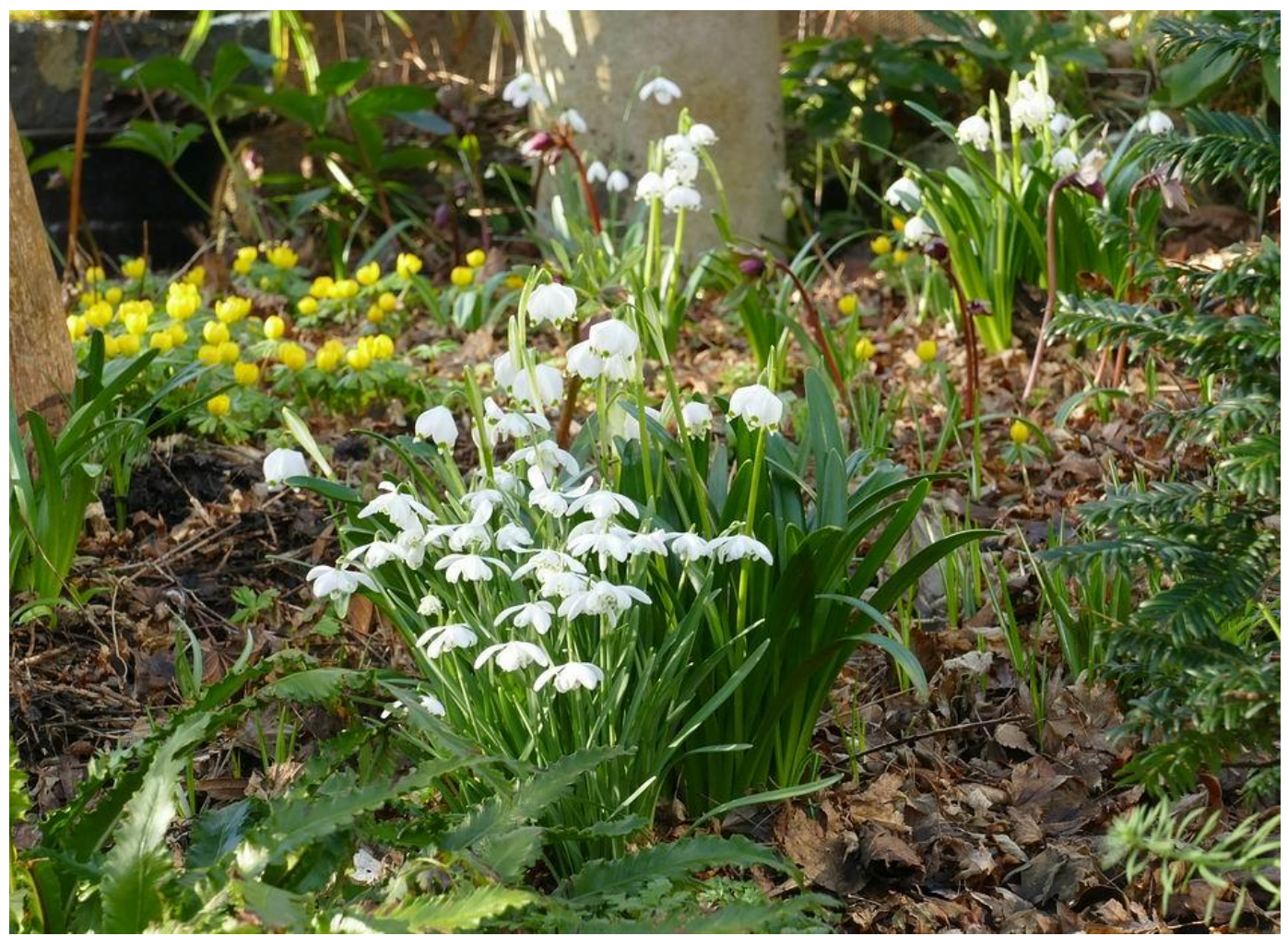
For those of you who are not familiar with studying plants here are some simple tips. Galanthus and Leucojum growing side by side are easy to distinguish as I have just stated.