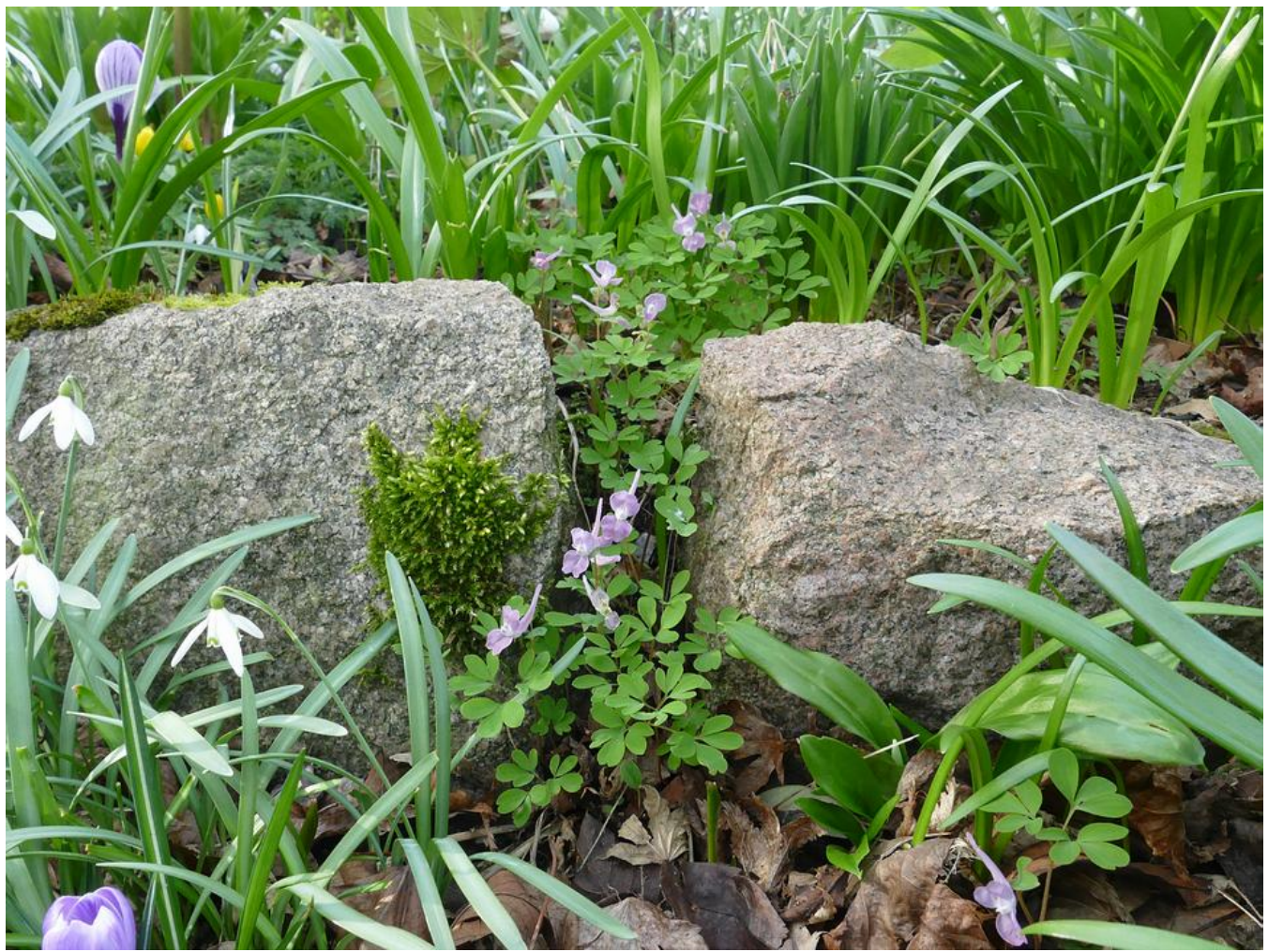
Nature is a much better planter than I am. Some of the best moments are made by nature who plants in places I may not have considered. These Corydalis caucasica seeded down the gap between the stones in a beautifully satisfying way. We should pay attention and be guided by nature.