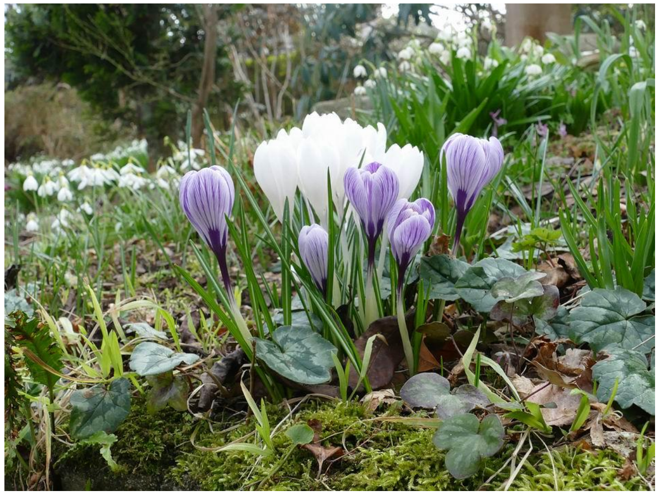
These Dutch Crocus vernus cultivars were among the very first bulbs we planted in the garden some fifty years ago before we discovered the wider world of plants that we went on to explore.

Being less tidy in the garden is not necessarily a bad thing. I have already cleared the old leaves away from this corner, where some Crocus heuffelianus grow, but when the wind blows this is where leaves end up so I will need to clear it again - but for now it can look natural.