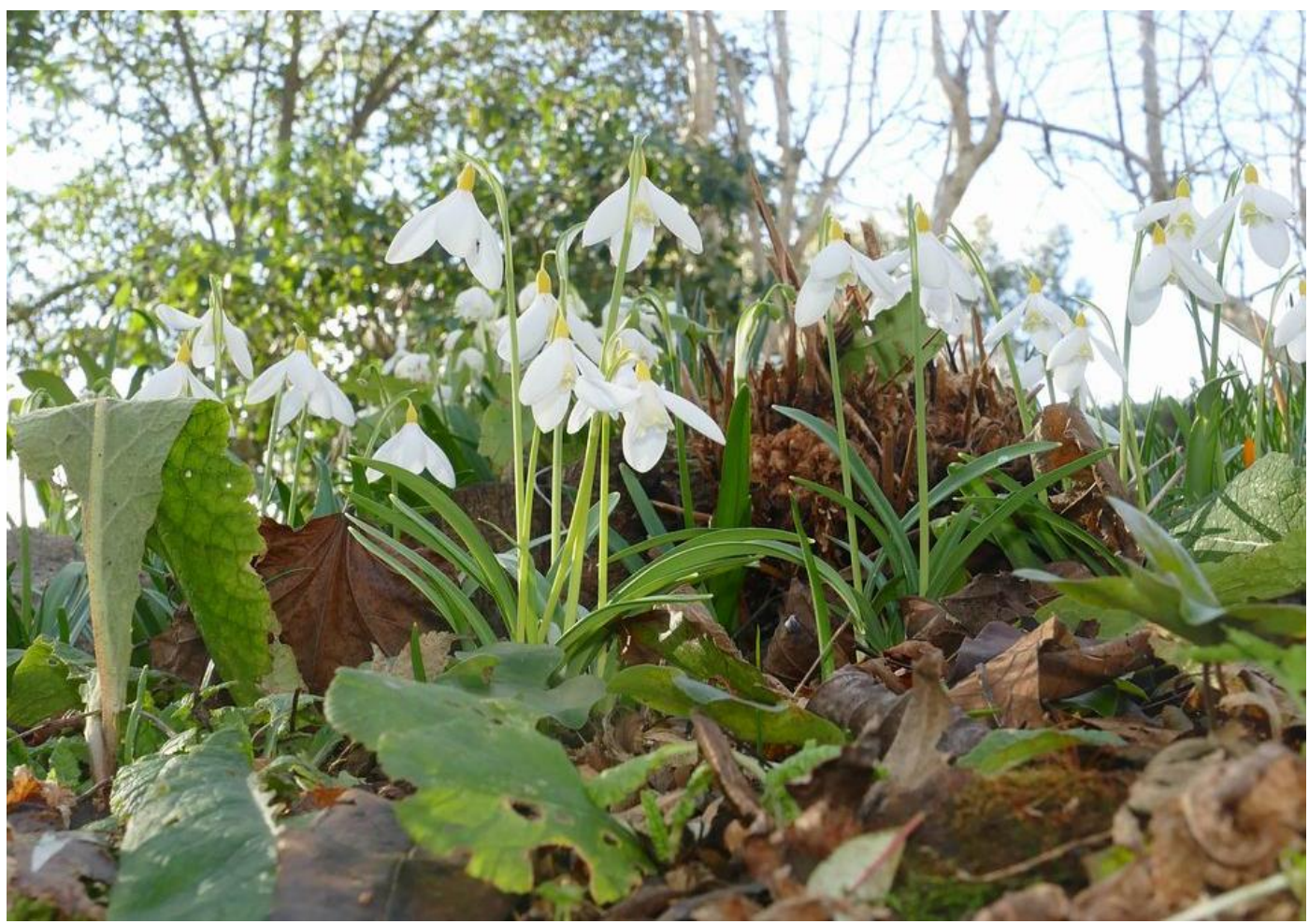
Anne Wright's excellent <u>Galanthus Dryad Gold series</u> have taken well to our garden growing and increasing in a number of habitats (above and below).