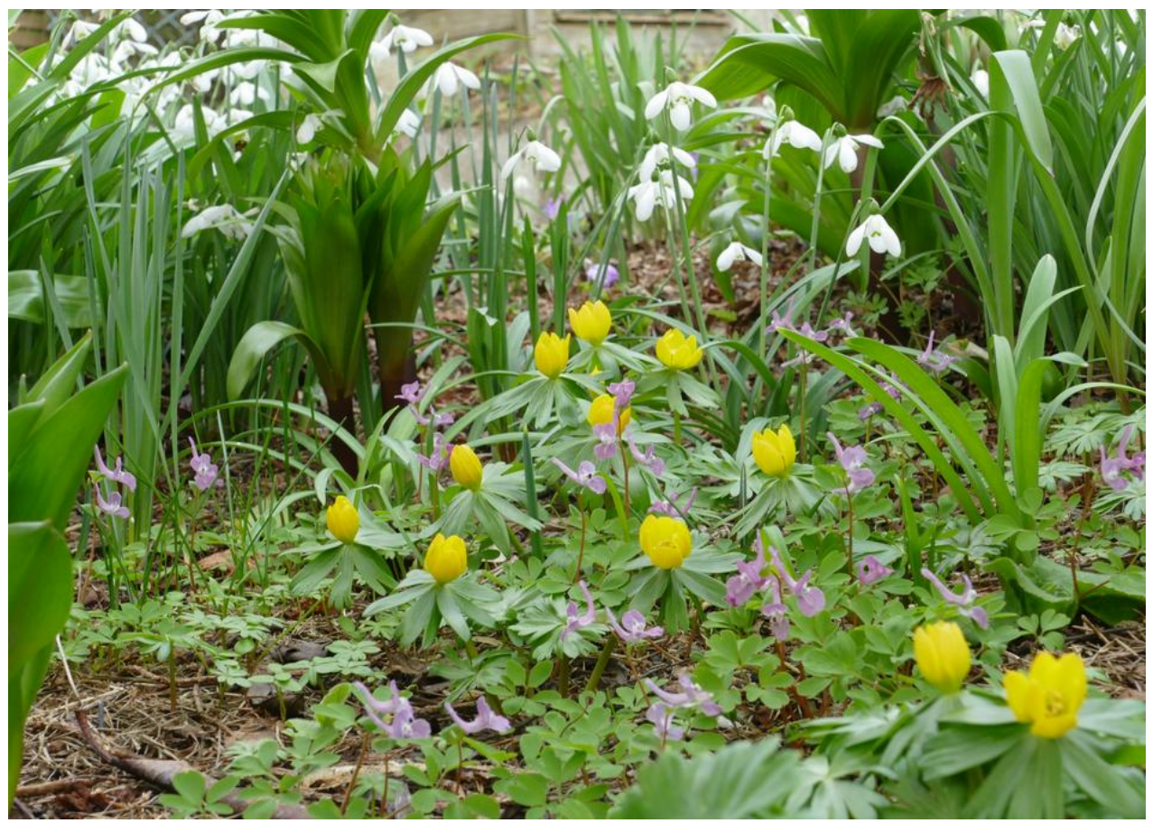
Both the Eranthis hyemalis and Corydalis caucasica growing here were introduced, like so many of our plantings, by simply scattering some seeds and letting the plants establish and seld seed.