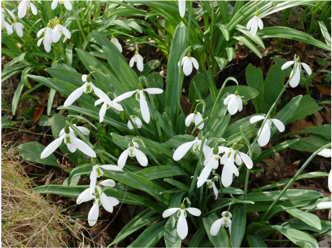
Broad shiny green leaves folded under at the margins – plicate.