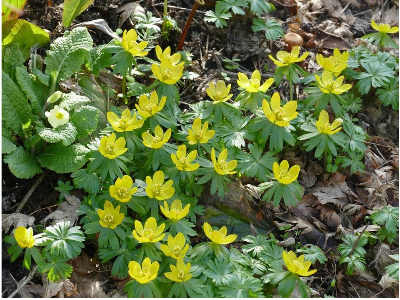
Eranthis hyemalis flowers enjoying what warmth there is from the sunshine.