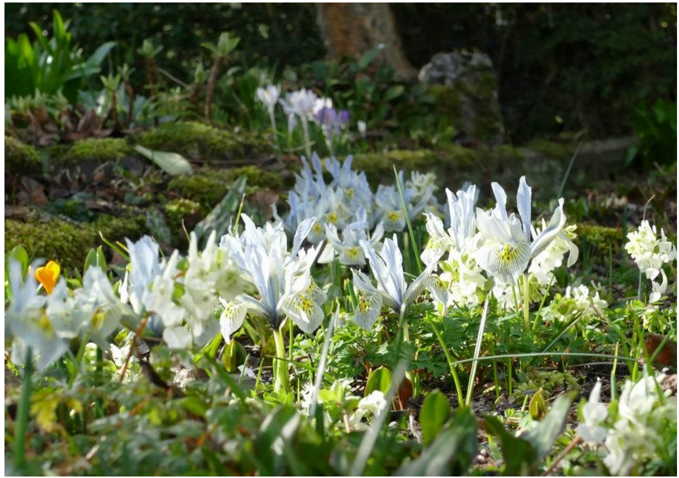
Bulbs like Iris 'Katharine Hodgkin' that do not set seed will need some help to spread out and look more natural.