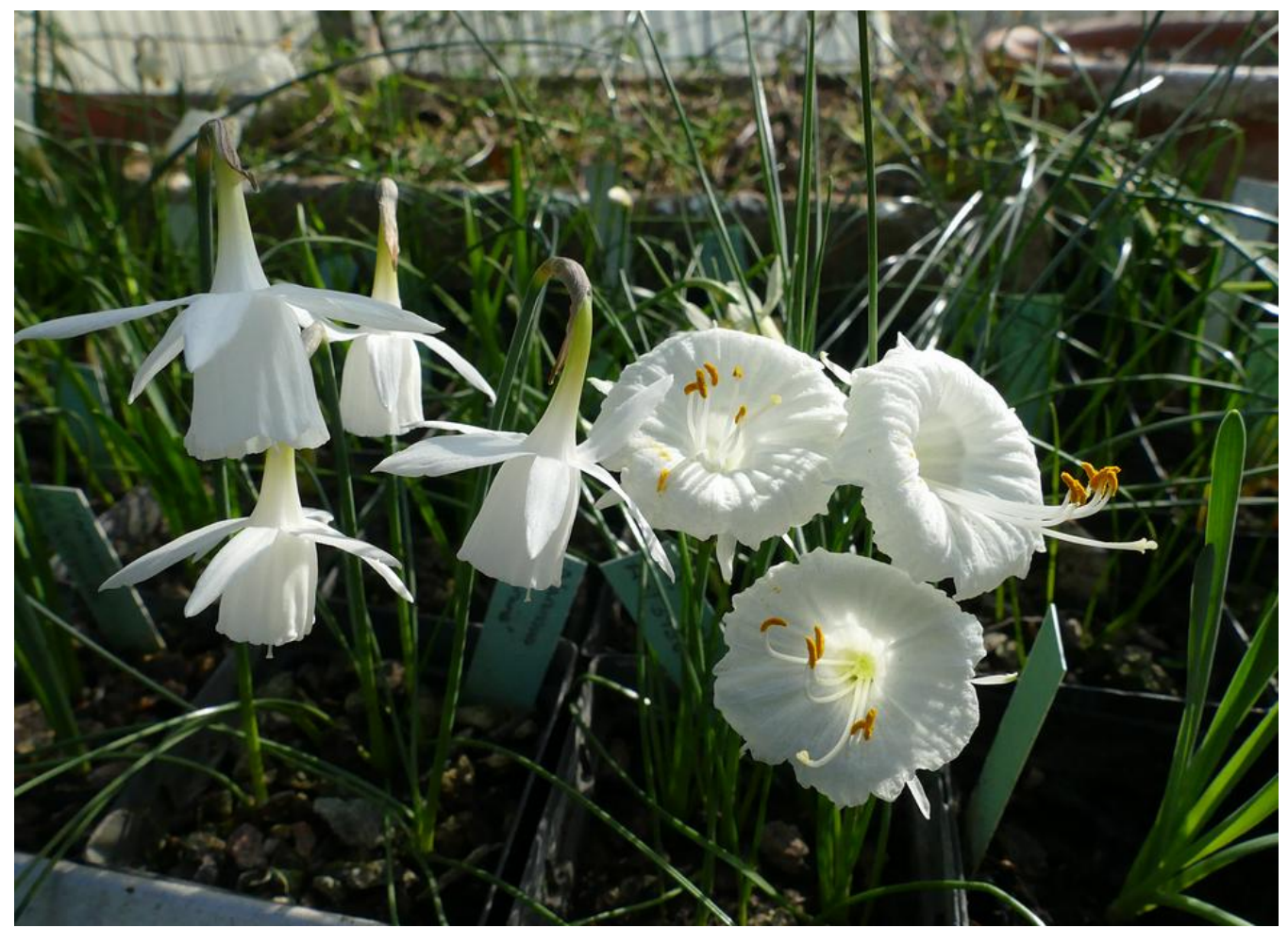
Among the ones in pots are these two Narcissus hybrids involving Narcissus cantabricus from the Dryad stable.