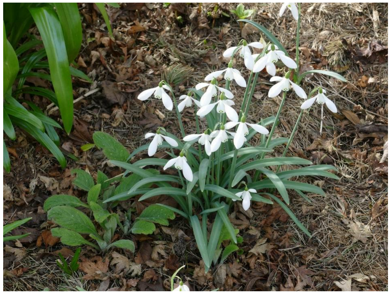
Narrow grey green leaves.

When the flowers are fully open note the degree of the reflex - how high they lift their petals. the leaves are always visible so note the colour are they green, grey or in between in addition check to see if they look wide or narrow.