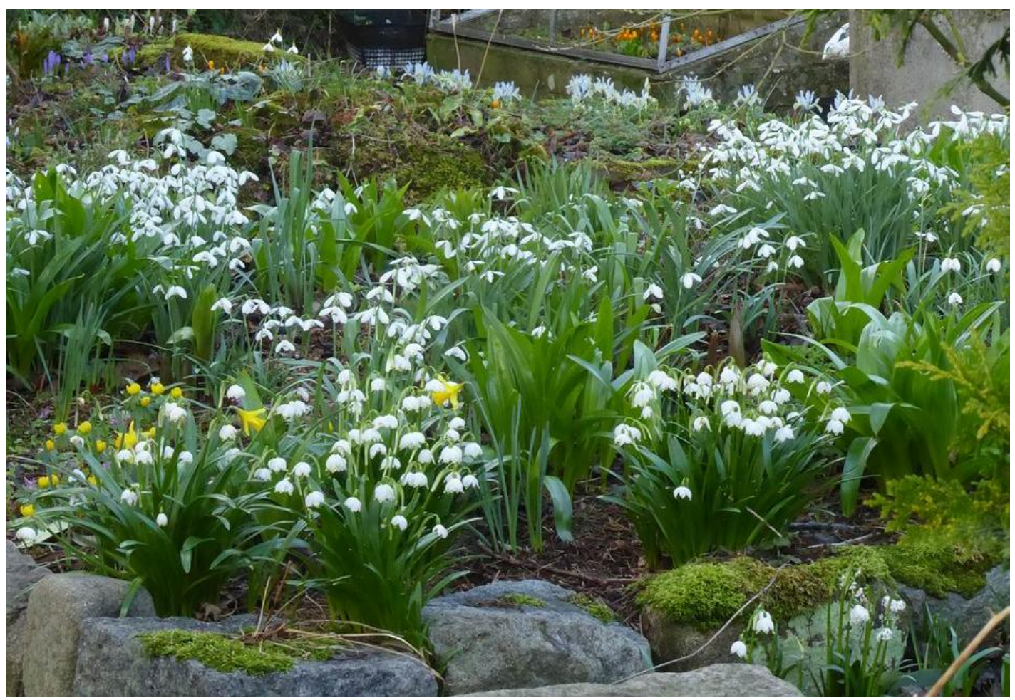
There are some significant differences between Snowdrops that are worth noting and easy to spot.