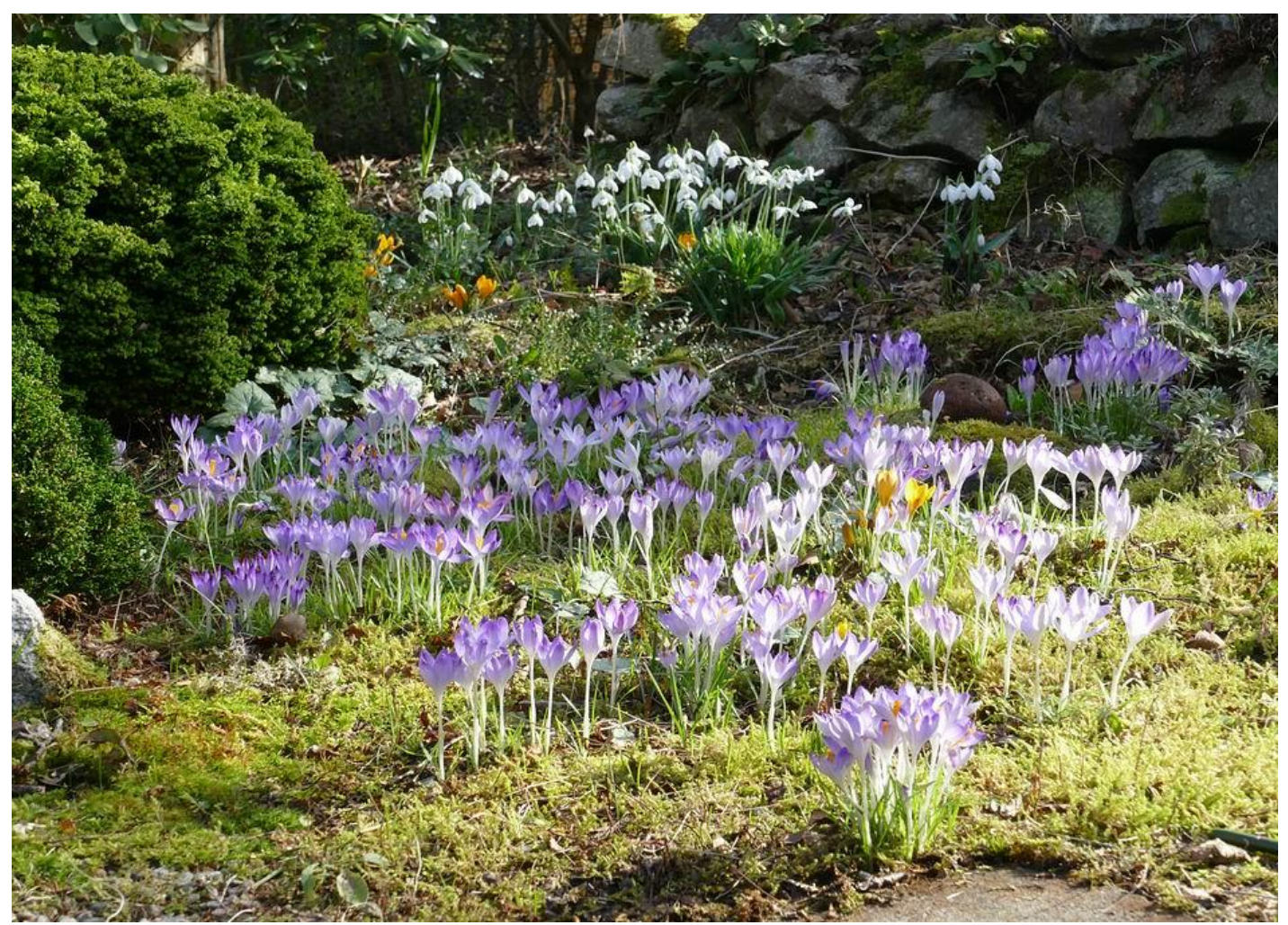
This is an update on the mossy area I discussed last month where a large group of Crocus tommasinianus seedlings are now flowering.