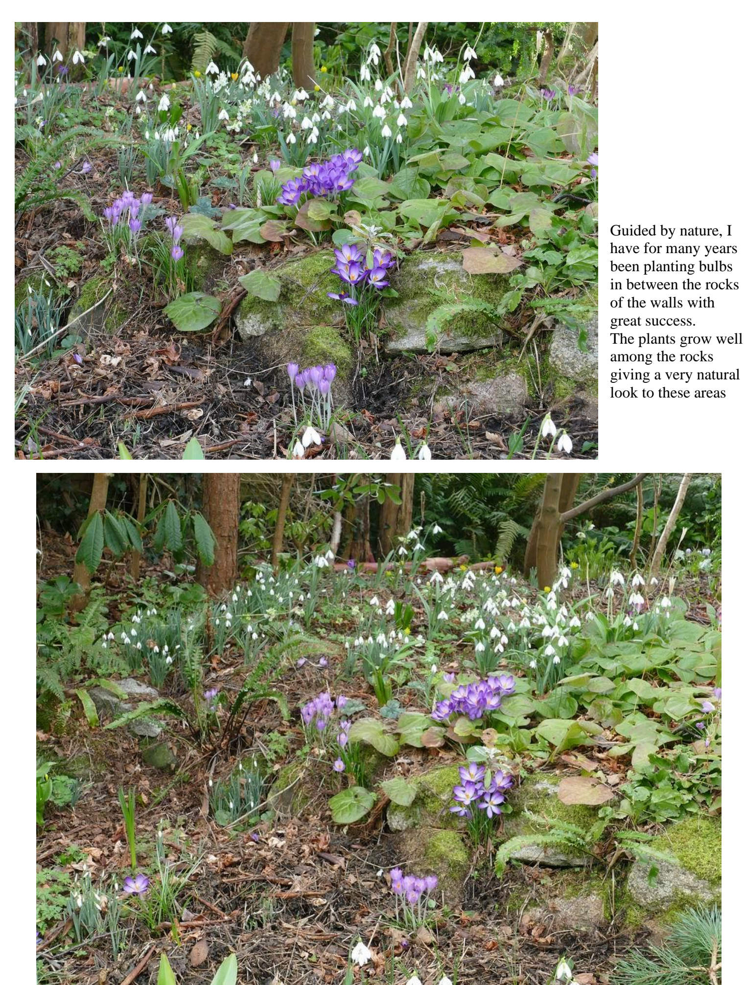
These Crocus tommasinianus are guiding the eye nicely down from the upper area, among the rocks, then linking to those growing in the lower bed.