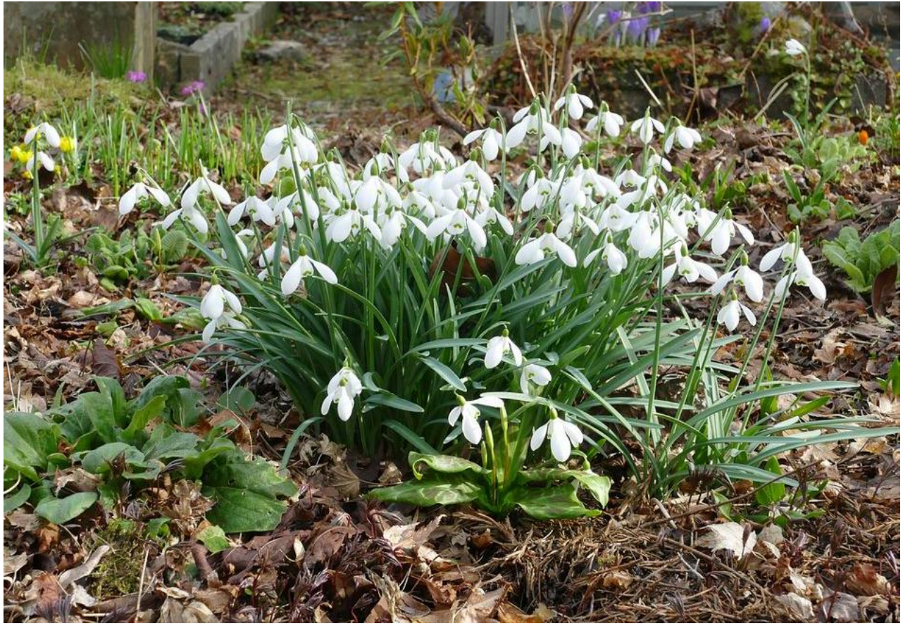
Your primary focus should be to enjoy and use the plants in your garden without worrying about what they may be called. One question that I am often asked is how to you get a garden to look like ours? The answer is that it takes time because it is a journey that you are going on. The instant gardens they used to show on the TV were just that - a garden for an instant. A garden without time. They may look attractive at first but how will they evolve?